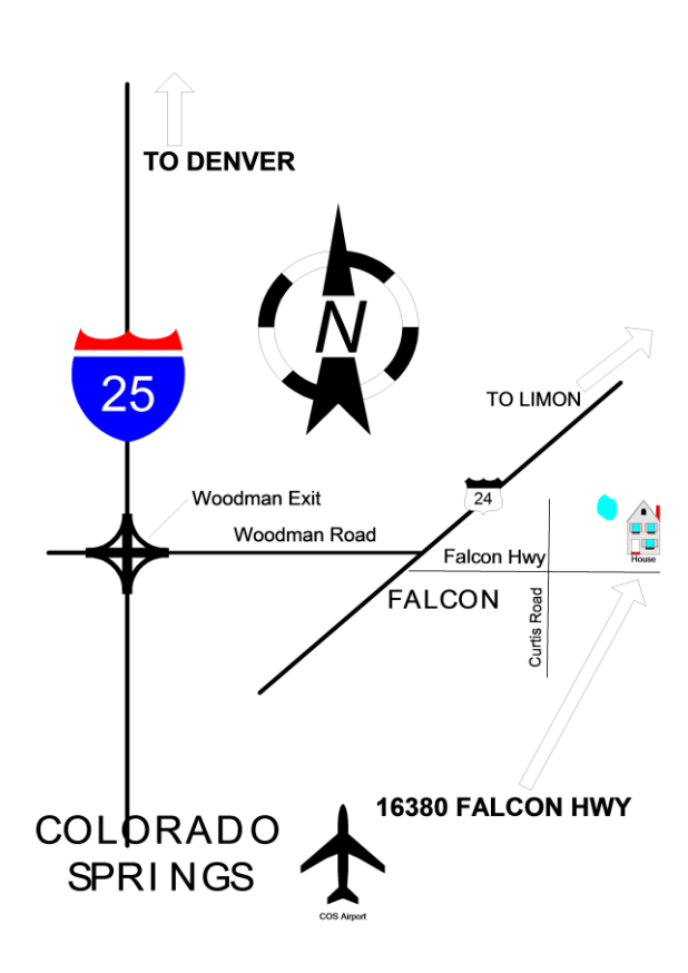
From I-25 North or South: Take Woodmen Road Exit and travel east to Highway 24. Turn Right on Highway 24 and then turn Left on Meridian. Go to stop sign and then Turn Left on Falcon Highway. Turn Left in drive way at 16380 Falcon Highway.